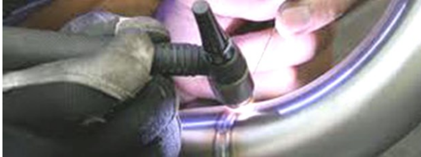
Custom Metal Fabrication Services