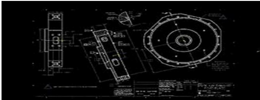
Using the latest in AutoCad technology