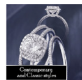
Contemporary and Classic styles