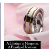
A Lifetime of Memories. A Family of Jewelers.