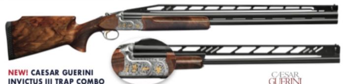
NEW! CAESAR GUERINI INVICTUS III TRAP COMBO