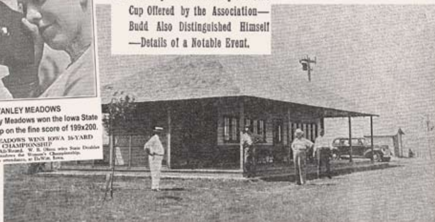
CLUBHOUSE OF THE CEDAR FALLS (IOWA) GUN CLUB, INC.

This club owns 40 acres of level ground and on account of the sandy soil, never has any mud. The equipment consists of four traphouses, all built over concrete pits, and a modern skeet field. The runways are concrete and a car load of targets can be stored in the traphouses. Several State shoots have been held there and the Northeast Iowa Zone shoot will be held there on July 6. A clear skyline and a bunch of good fellows make this one of the best shooting grounds in Iowa. And everything is paid for, including 36,000 targets; money in the bank and no bills. Earl Eiler is secretary.