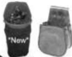
Mesh & Leather Empty Pouches

NEW Club-Team Program Special pricing with minimum order Call for details.