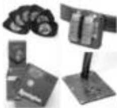
Accessories Binoculars, Magazine Pouches, Clips, and more!