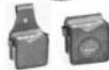
Single Shell Pouches Over 20 Combinations