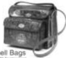
Shell Bags Over 80 Combinations