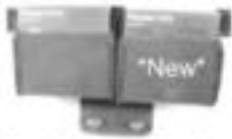
Double Shell Pouches Over 20 Combinations